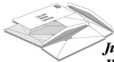
Junk Mail & Home Office Paper

Cereal, cracker, pasta, tissue, shoe, gift, etc. (discard plastic liner and flatten.)