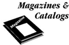
Magazines & Catalogs