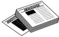
Newspapers & Inserts